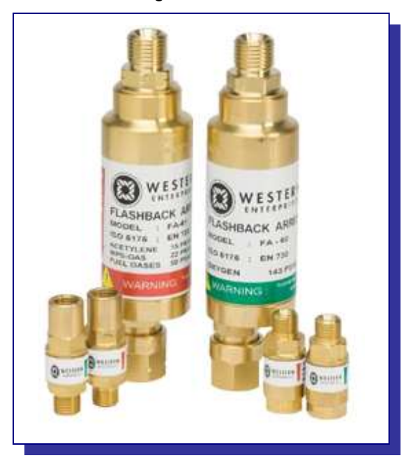
Color Coded for easy Identification

A backfire or flashback occurs when mixed gases are ignited in the torch, hose or regulator. Flashback arrestors are designed specifically to help prevent and stop these dangerous situations by preventing reverse flow of gases and quenching backfires and flashbacks at the torch or regulator.