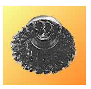
4" Knot Wire Cup -Double Row Wire 00232

esigned for heavyduty cleaning with portable power tools, including right angle grinders, sander polishers, etc. Available in a range of cup diameters and filament knot styles to properly fit your application requirements, including pipe cleaning, structural steel, weld cleaning, tank car and ship fabrication and nuclear power plant construction.