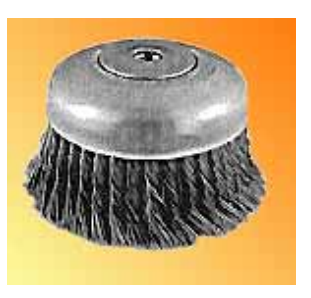
6" Knot Wire Cup -Single Row Wire 00206