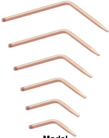
Model 23-A-90 & 5090 Welding Tips