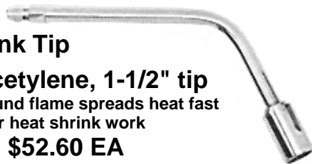
ST07A Acetylene, 1-1/2" tip Soft wraparound flame spreads heat fast and evenly for heat shrink work $52.60 EA