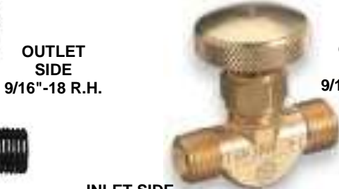
OUTLET SIDE 9/16"-18 R.H.