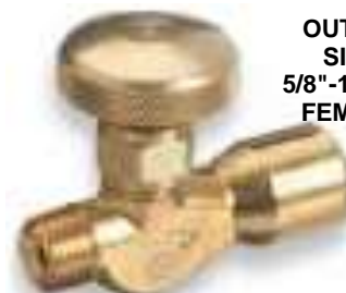
OUTLET SIDE 5/8"-18 R.H. FEMALE