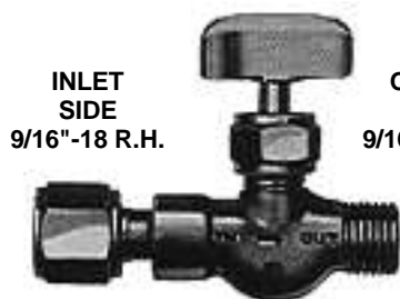
INLET SIDE 9/16"-18 R.H.