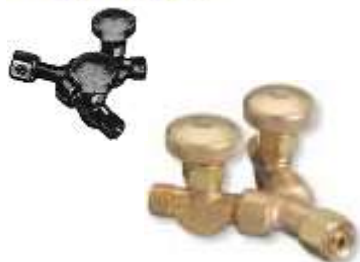
ITEM NO. 111