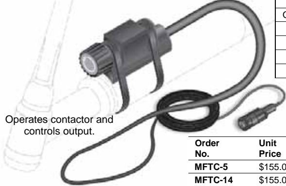
Operates contactor and controls output.