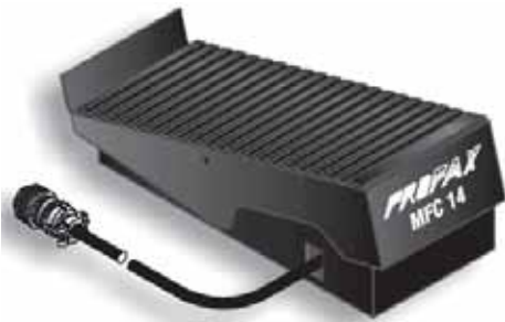
ALL METAL CONSTRUCTION Operates contactor and controls output.

See previous page for Matching Extension Cords