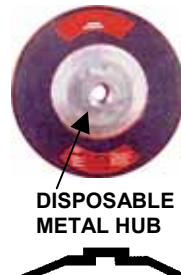
DISPOSABLE METAL HUB