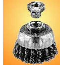
Arbor Adapters available

CONVERT ANY POWER TOOL TO A STANDARD 5/8-11 THREAD