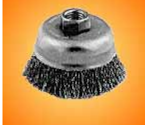
Crimped Cups (3" diameter)

All brushes are 7/8" trim length and 12,500 RPM Maximum Safe Free Speed.