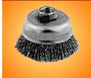
Crimped Cups (3" diameter)

All brushes are 7/8" trim length and 12,500 RPM Maximum Safe Free Speed.