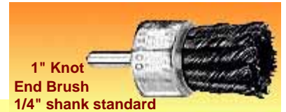
1" Knot End Brush 1/4" shank standard

Suitable for removing heavy carbon deposits and pipe I.D. cleaning