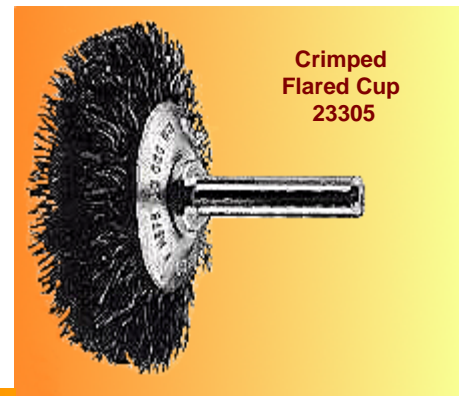
Crimped Flared Cup 23305