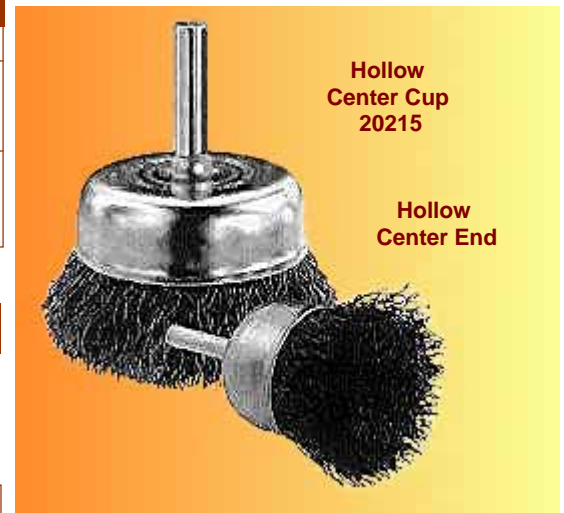
Hollow Center Cup 20215