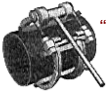
No. 1 "STANDARD" ("TIPTON")

Holds the two ends of pipe together while welding. Tightened with hand lever or with powerful "Simplex" hydraulic jack providing over 16,000 lbs. pressure. Easy, quick and accurate alignment.