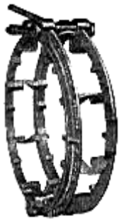
No. 3 STANDARD "NO-TACK" ("TIPTON")

The arched cross-bars permit complete round-about welding without removing clamp. This eliminates tack-welds and makes better x-rays.