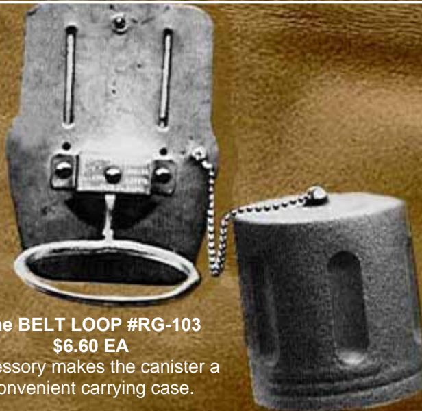
The BELT LOOP #RG-103 $6.60 EA Accessory makes the canister a convenient carrying case.