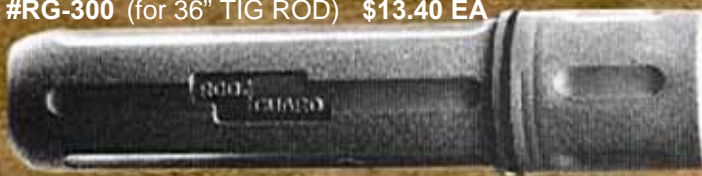
Rod Guard® Canister - Withstands 225°F temperature